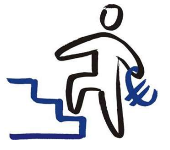
CULTIVATING TALENTS: Development of human resources